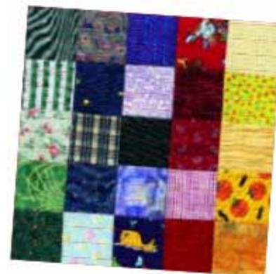
Permission is granted by Love of Quilting to copy these instructions.